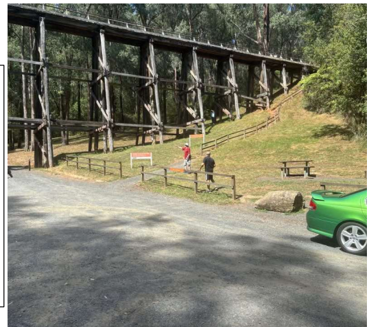
Right: The Noojee Trestle Bridge – one of the stops on the challenge where teams had to answer some questions about the bridge.