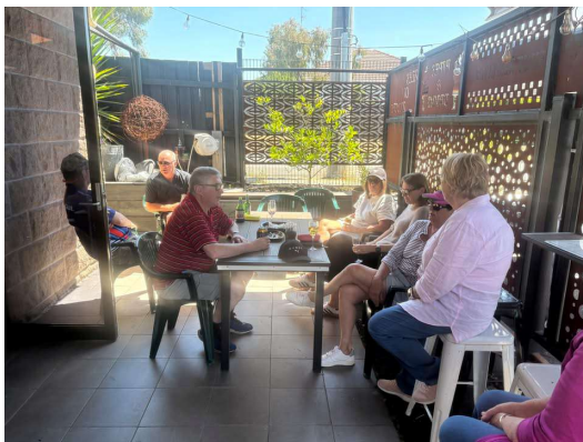
Left: Back at the RSL for a lovely BBQ lunch.