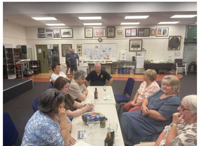
Right: The ladies having a quiet catch up in the hall.