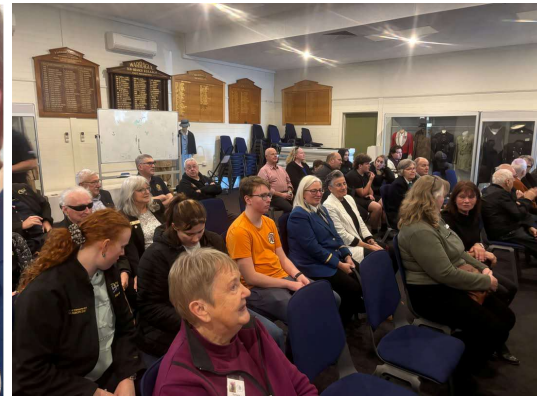
Attendees at the George Eyre Event