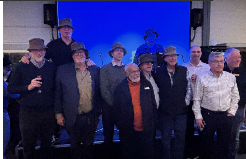
South African Ex-servicemen (members of SAMVOA) proudly wearing their bush hats