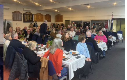
The popular event was well attended with a South African styled dinner of tomato and beef stew on mash followed by delicious Melva sweets